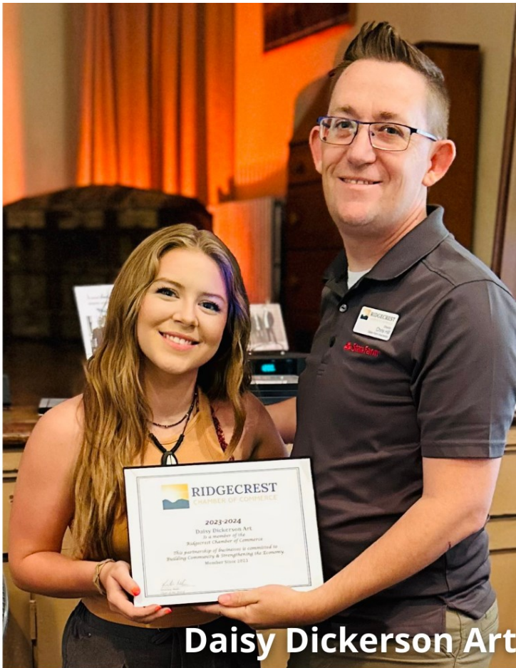
Daisy Dickerson Art