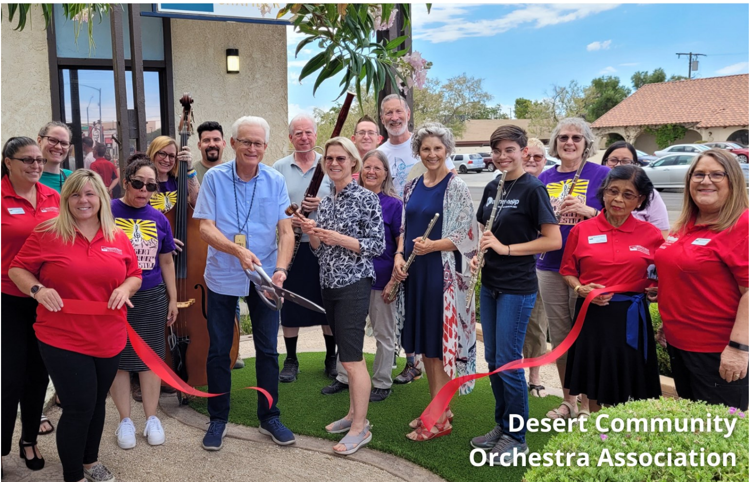
Desert Community Orchestra Association