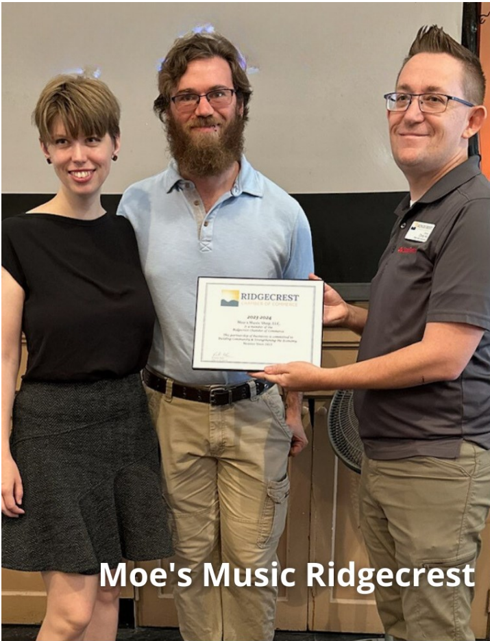
Moe's Music Ridgecrest