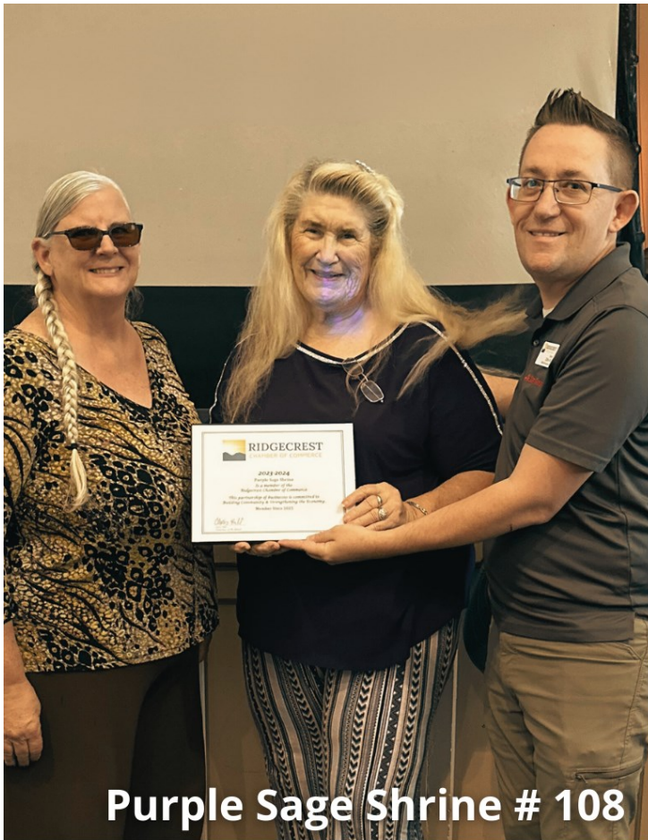
Purple Sage Shrine # 108