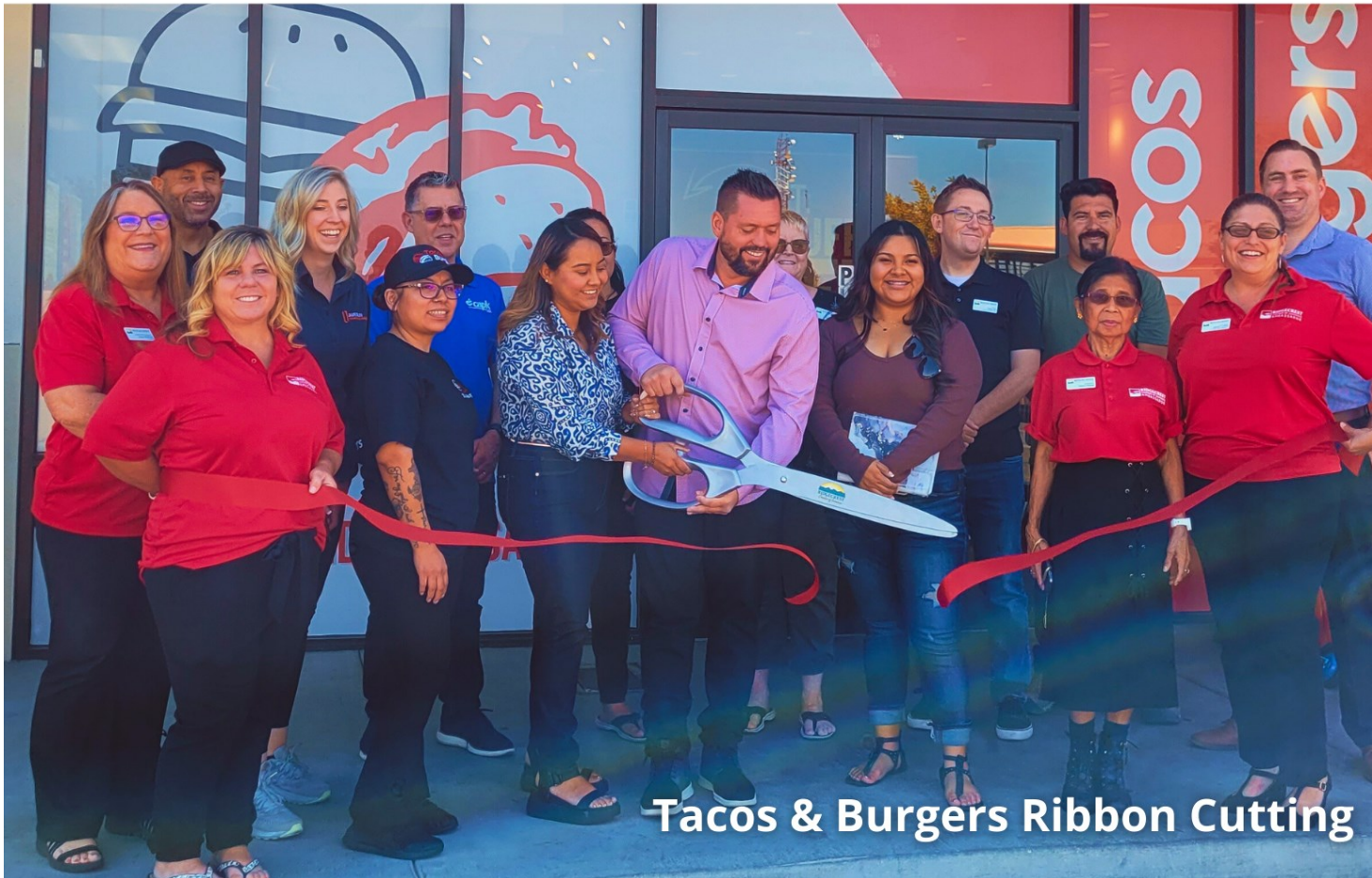
Tacos & Burgers Ribbon Cutting