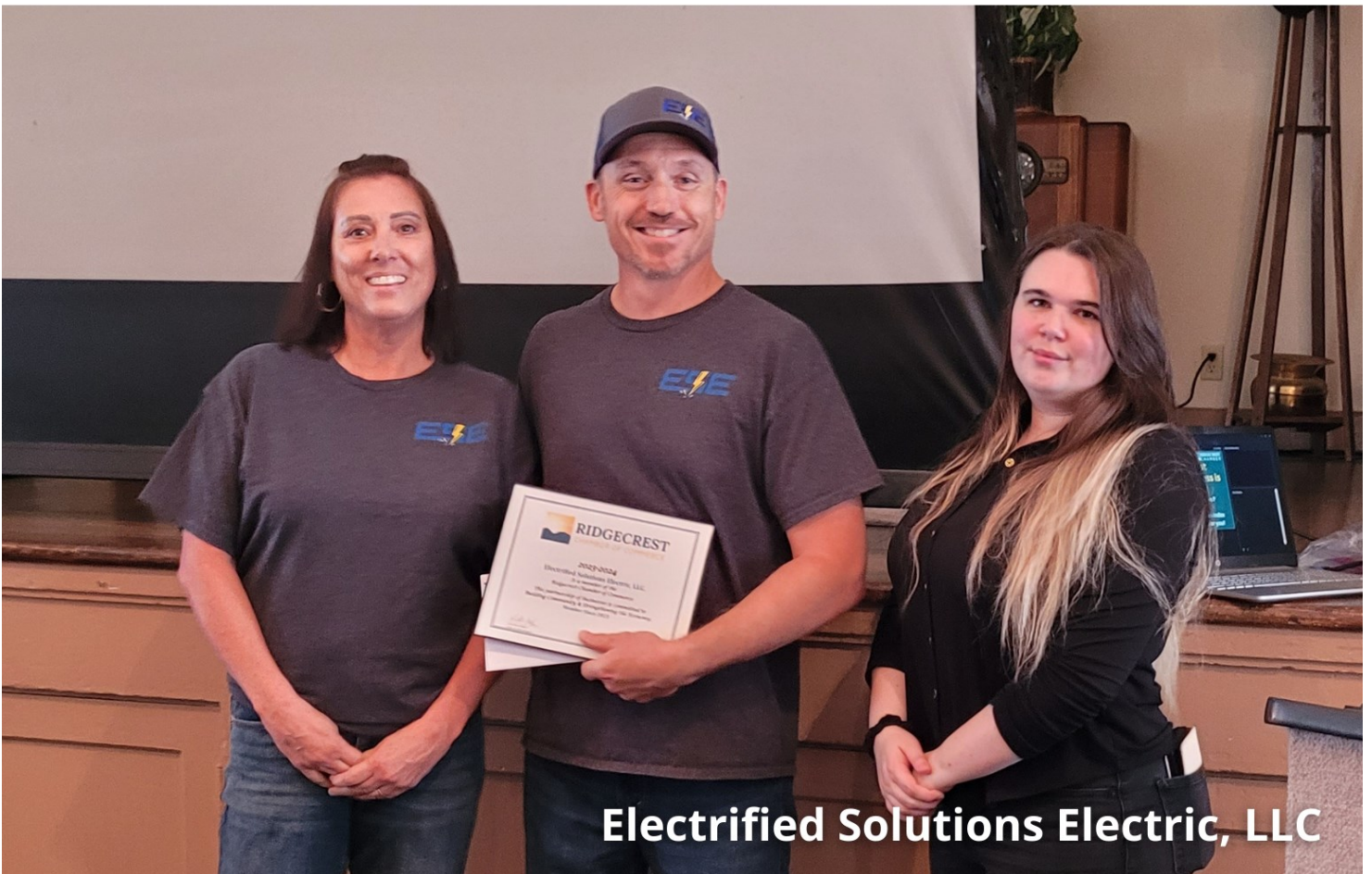
Electrified Solutions Electric, LLC