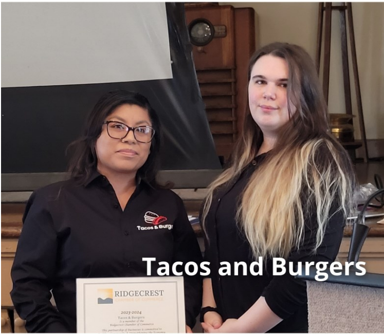
Tacos and Burgers