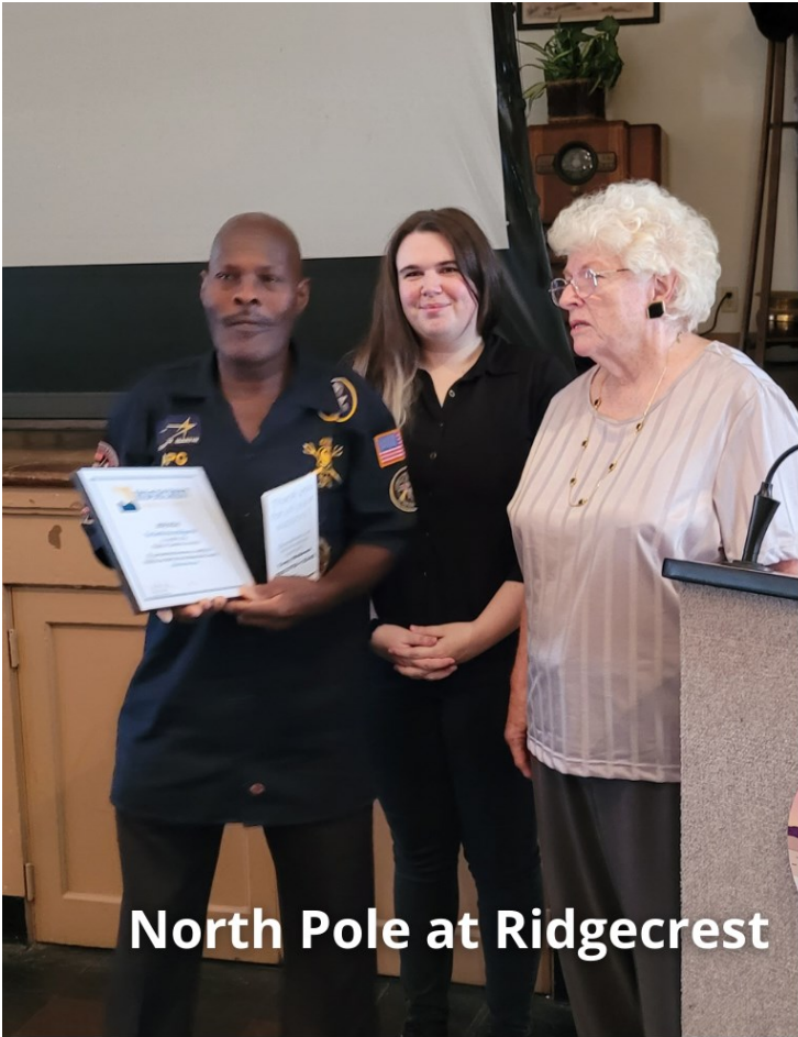
North Pole at Ridgecrest