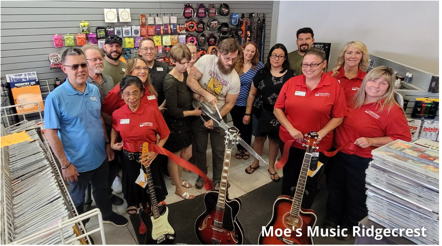
Moe's Music Ridgecrest