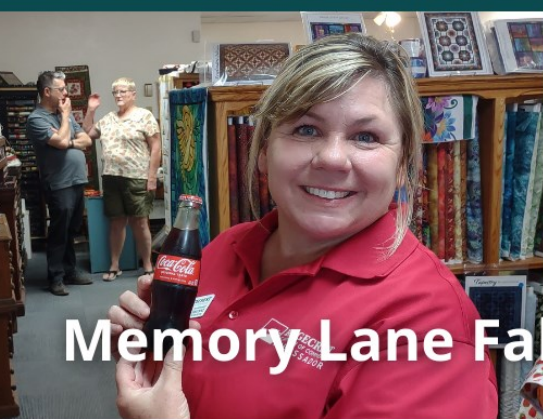
Memory Lane Fabric and Quilts Business After Hours